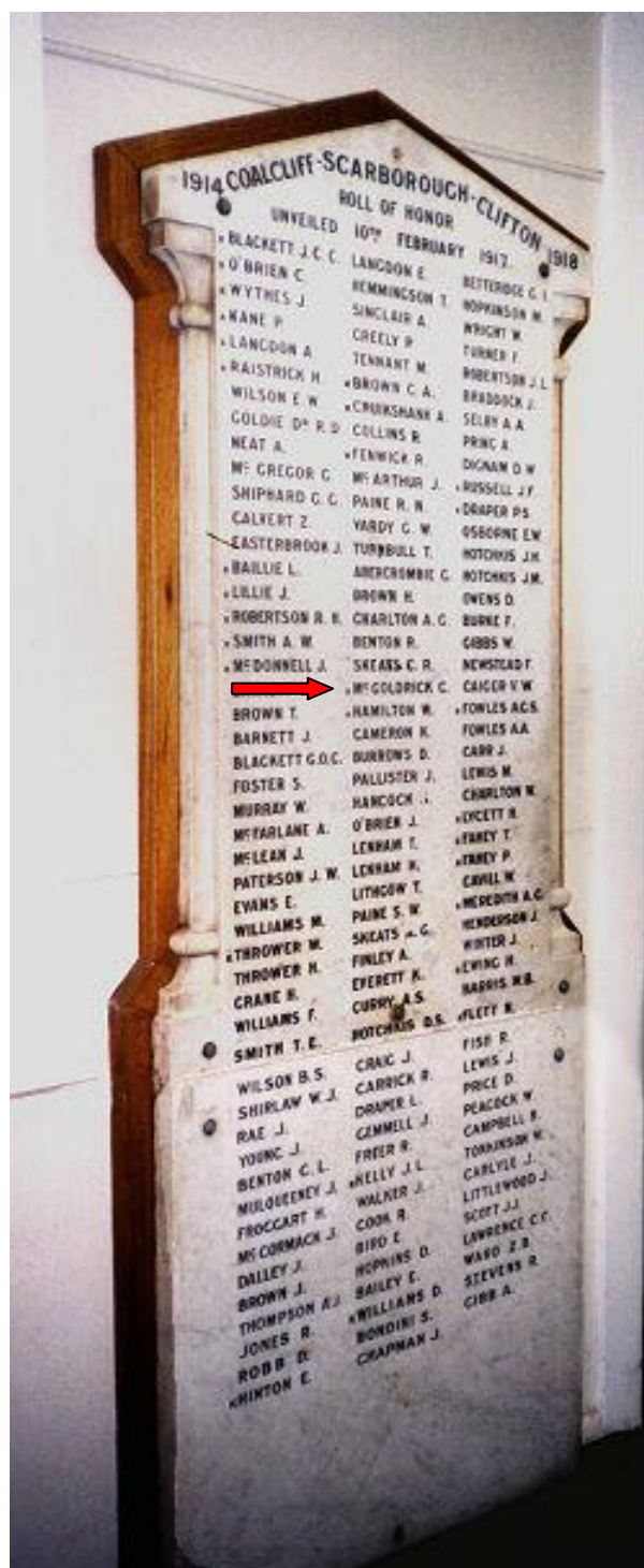
Coalcliff, Scarborough, Clifton Roll of Honour